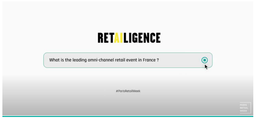
Discover the teaser For 2024 edition Paris Retail Week

See you from 17 to 19 September! Paris Porte de Versailles - Pav 7.3